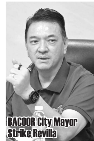
BACOOR City Mayor Strike Revilla

The meeting was led by Mayor Strike B. Revilla and coordinated by Mr.