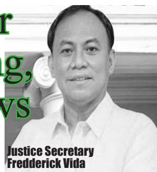
Justice Secretary Fredderick Vida

The department made proposals to strengthen border control and monitoring systems, including vessel registration, maritime surveillance, and tighter oversight of irregular migration corridors often exploited by traffickers.