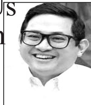
Sen. Bam Aquino

The construction of new classrooms is expected to boost employment and local economies, as it will create