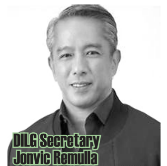
DILG Secretary Jonvic Remulla

Ang Safer Cities Initiative ay ipinatutupad upang maiwasan ang anumang kaguluhan o kriminalidad, ayon kay DILG Sec. Jonvic, na siyang may hurisdiksyon sa Philippine National Police (PNP).