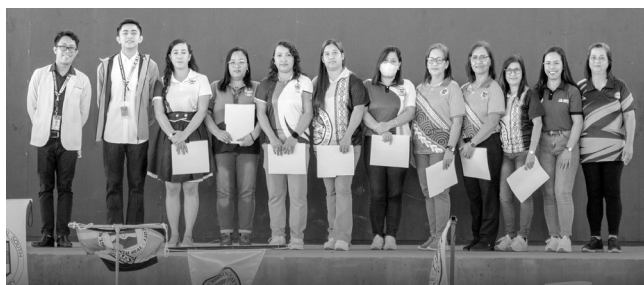
Newly Elected BHW Officers

The City Government of Tagaytay marked World Health Day on April 7, 2026, with meaningful activities that highlighted the dedication of modern-day frontliners and reinforced its commitment to community health and welfare.