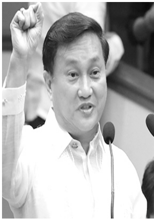
Senator Francis "TOL" N. Tolentino

The games of PRG's Luzon leg will be held inside the Cavite State University (CAVSU) in Indang, Cavite and in Tagaytay City, starting Sunday, September