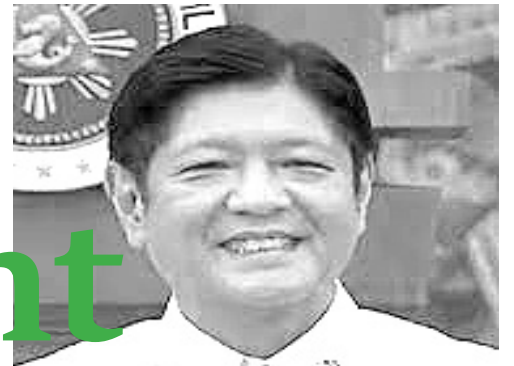
Pres. Ferdinand R. Marcos Jr

GENERAL TRIAS, Cavite (PIA) -- President Ferdinand R. Marcos Jr. led on Friday the inauguration of Unilever's P4.7 billion-personal care facility in General Trias, Cavite, which he said was a result of his trip to Belgium.