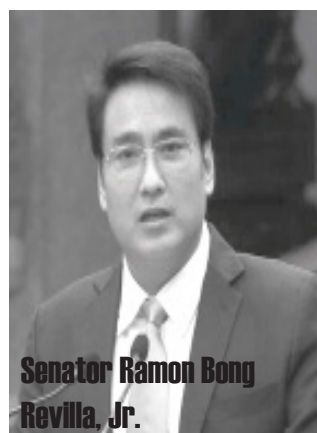
Senator Ramon Bong Revilla, Jr.

"The hearings and TWG (technical working