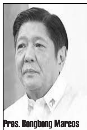
Pres. Bongbong Marcos

President Marcos Jr. is given a briefing inside the Motion Bridge Simulator, particularly its significance in the construction of the project, and leads the ceremonial switching of the Bataan-Cavite Interlink Bridge Geotechnical Inves-