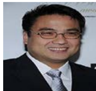
Sen. Bong Revilla

He filed S. No. 1121, "An Act Providing for the Mandatory Inclusion of Anti-Obesity Education Program and Exercise including Play and Traditional Games, in the Pre-School, Elementary and