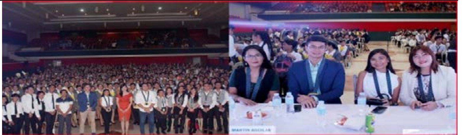
Participants in the recent Cavite Tourism Forum held at the General Trias Cultural Convention Center