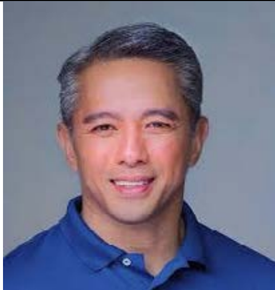
Governor Jonvic Remulla