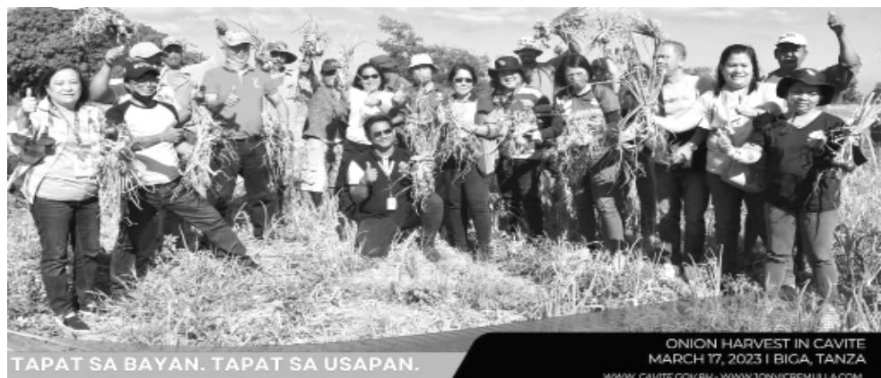
TAPAT SA BAYAN. TAPAT SA USAPAN.