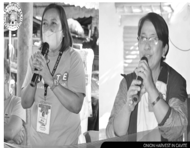
ONION HARVEST IN CAVITE