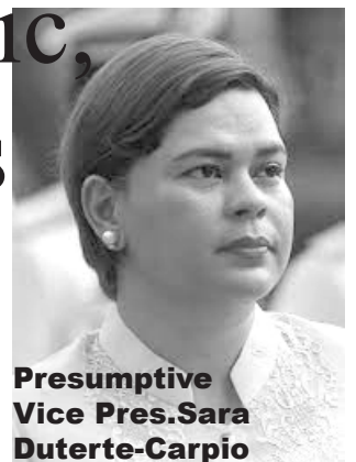
Presumptive Vice Pres. Sara Duterte-Carpio

"Our country needs a future generation of patriotic Filipinos that advocate peace and discipline in their respective communities," Duterte-Carpio said in a statement Thursday, May 12.