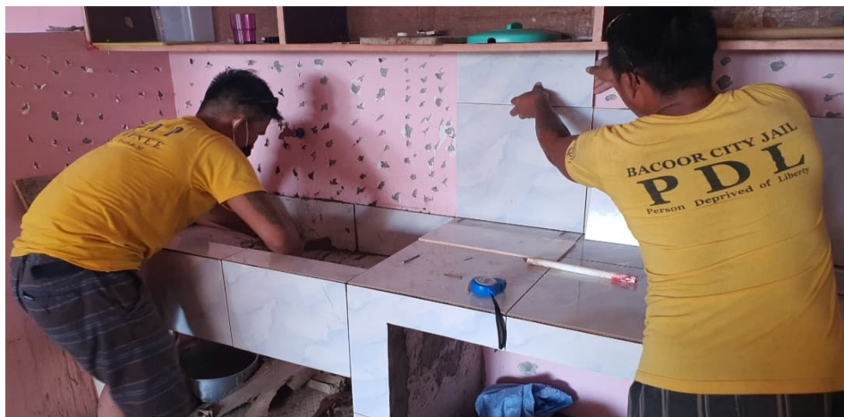
The temporary kitchen was put-up to adequately provide the needed food requirements of the PDLs upon transfer to the new facility, pending the construction of the permanent kitchen.

BACCOOR CITY, Cavite(PIA) -- The new Bacoor City Jail Male Dormitory (BCJ-MD), a newly completed jail facility in the city is now host to 1,356 Persons Deprived of Liberty (PDLs) transferred from the old cramped facility.