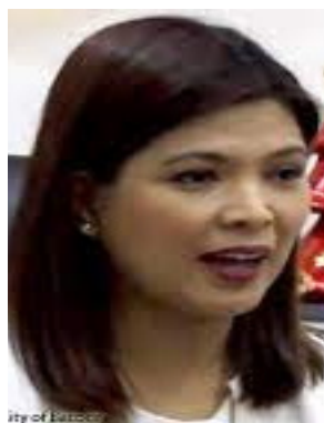
Bacoor City Mayor Lani Revilla

The newly-completed jail facility was built with the allocation of multi-million budget thru the Peace and Order and Public Safety (POPS) Plan for FY 2020-2022.