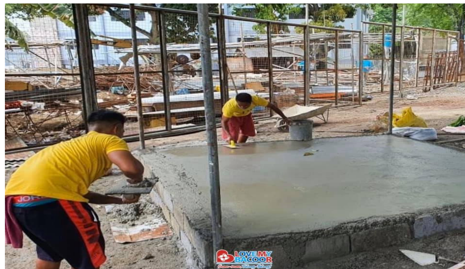
The Kabalik Hall Duty post/Multi-purpose area was constructed to provide BJMP personnel with more conducive work space and at the same time, utilize as multi-purpose area for service providers, visitors, and clientele.