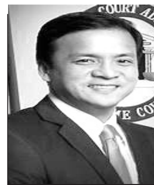
Associate Justices Jose Midas P. Marquez

Bacoor City, March 13, 2025 – Bacoor City witnessed a momentous occasion today with the blessing of six new branches of the Regional Trial Court (RTC), a significant step towards enhancing the city's justice system. The event, organized by the City Government of Bacoor under the leadership of Mayor Strike B. Revilla and the Regional Trial Court, was held at the 2nd floor of Main Square Mall.