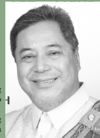
Health Secretary Teodoro Herbosa

"Sa maagang screening, mas mapapababa ang panganib ng cancer dahil mas magiging maaga ang