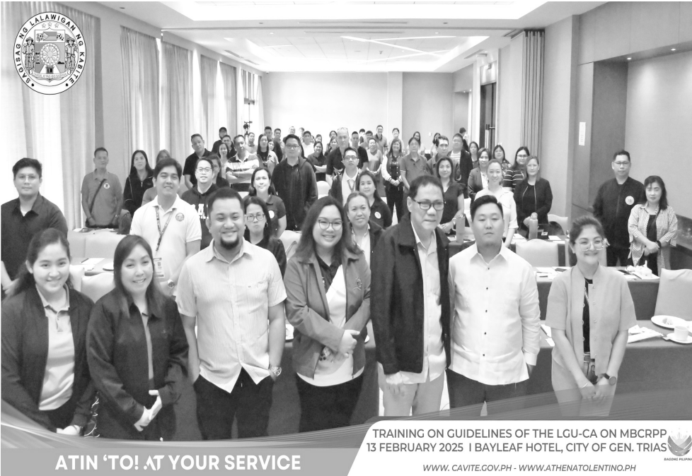
ATIN ‘TO! AT YOUR SERVICE

TRAINING ON GUIDELINES OF THE LGU-CA ON MBCRPP 13 FEBRUARY 2025 | BAYLEAF HOTEL, CITY OF GEN. TRIAS WWW.CAVITE.GOV.PH - WWW.ATHENATOLENTINO.PH