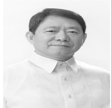
DILG Secretary Eduardo M. Año

DILG Secretary Eduardo M. Año said that Quarantine Control Points (QCP) manned by combined elements of the Philippine National Police, Armed Forces of the Philippines, Philippine Coast Guard and the Bureau of Fire Protection will be placed at the borders of