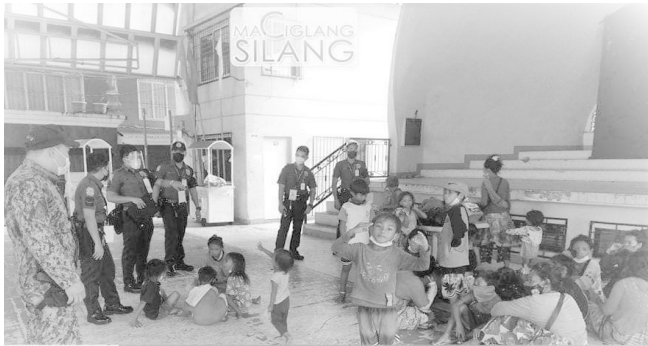
Tinipon ang mga Badjao sa Silang Plaza West Tricycle terminal pansamantala.

ing ireport sa tanggapan nila para maibalik sa tunay nilang tahanan.