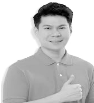
MAYOR DENVER CHUA