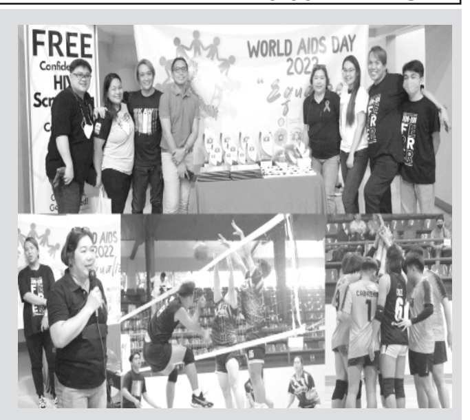
World AIDS Day 2022 Celebration at General Trias Sports Complex, City of General Trias, Cavite last December 9,