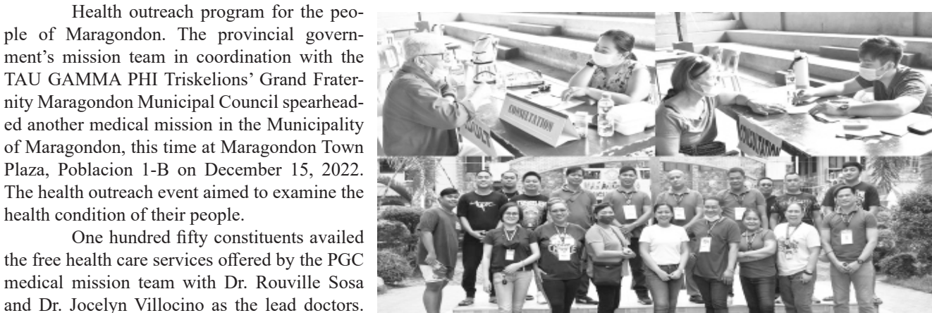
Prior to the consultation, they engaged in anti- Health program in Municipality of Maragondon

La Union is one of the 71 identified UHC Integration sites in the country.