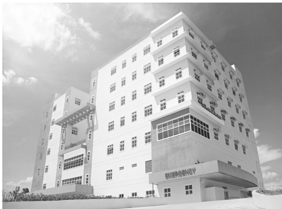
San Pedro Calungsod Medical Center, Kawit, Cavite.