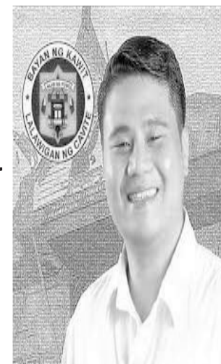
Mayor Angelo Aguinaldo

Reiterating that the vaccine supply from the national government is not sufficient to vaccinate every-