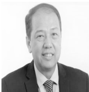
Secretary Carlito G. Galvez, Jr.

The newly built mega vaccination facility's drive-thru service also features an ambulatory vaccination area for walk-ins which