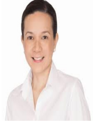
Sen. Grace Poe

The government's chief audit agency said the deficiencies contributed to the challenges and missed opportunities encountered by the DOH at the present state of national emergency, and cast doubt on the regularity of re-