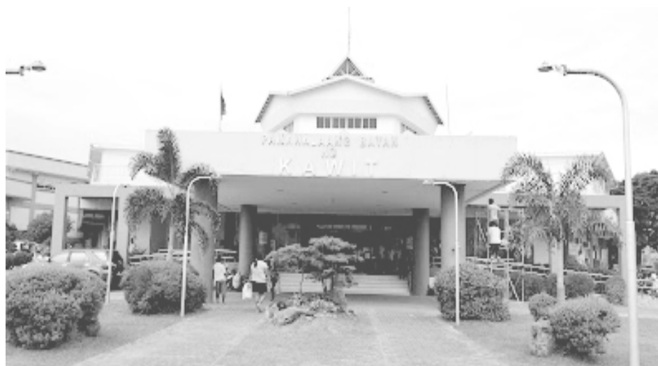
Kawit Municipal Hall Complex

presented documents in the registration centers and collection of biometric captures such as facial photographs, full of fingerprints, and iris scans will be done in Step 2 PhilSys process.