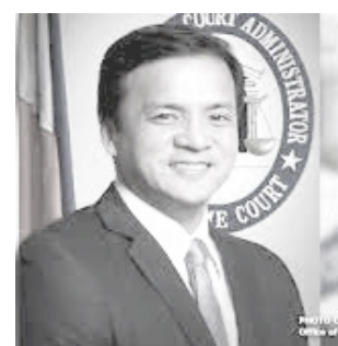
Newly-appointed SC Justice Jose Midas Marquez

"I'd like to announce that Executive Secretary confirms that Jose Midas Marquez has been appointed associate justice of the Supreme Court. Congratulations to Justice Jose Midas Marquez," acting Presidential Spokesperson and Cabinet Secretary Karlo Nograles said in a virtual presser.