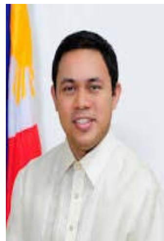
(DPWH) Sec. Mark Villar

"This is the Laguna portion of CALAX and by the end of the month, the 10-kilometer segment