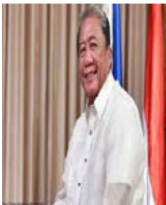
Secretary Arthur Tugade

BACOR CITY, Cavite (PIA) – Officials of the Department of Transportation (DoTr), Department of Public Works and Highways (DPWH) and the Local Government Unit (LGU) of Bacoor once