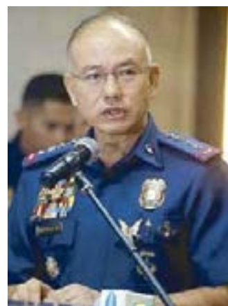
Gen. Oscar Albayalde

SILANG, Cavite -- The government's fight against terrorism in the Philippines will be strengthened after the recent groundbreaking of the first-ever counter-terrorism training center in Southeast Asia here.