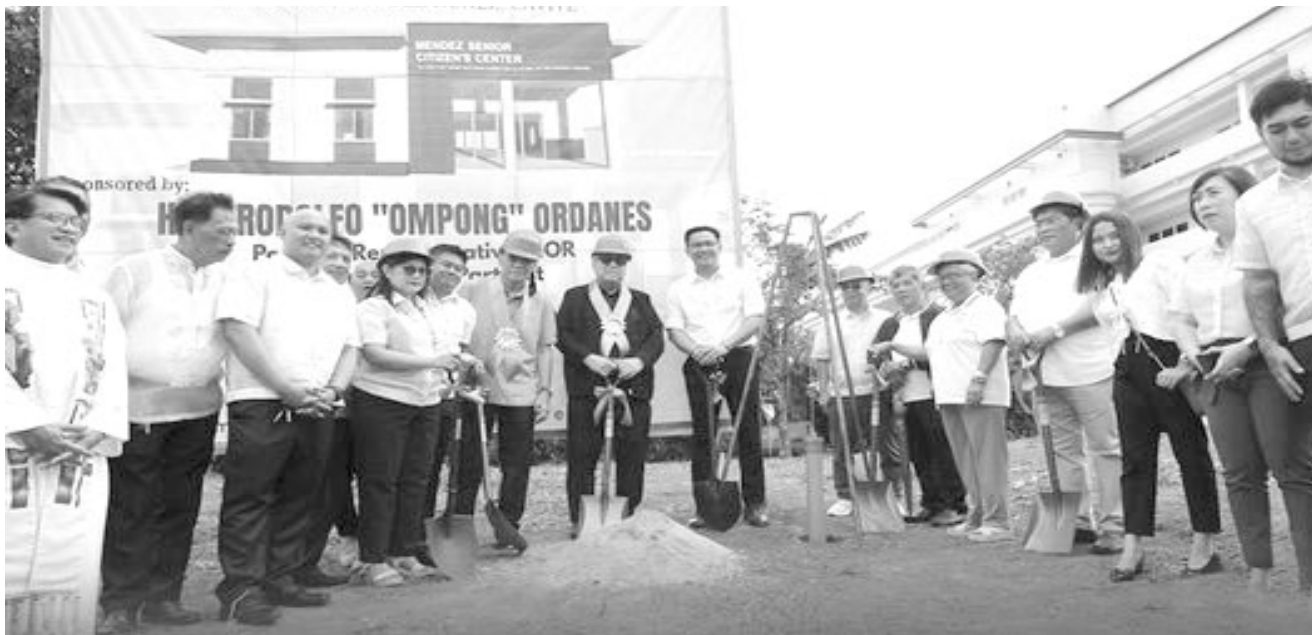
Ground breaking of Mendez Senior Citizen's Center in Galicia III, -Nuñez , Cavite

The authorities said they actually caught the five suspects doing a shabu session and recovered from them 12 grams of shabu, aluminum foil, plastic sachet and other drug paraphernalia. Corresponding Case will be filed against the five suspect./LLE