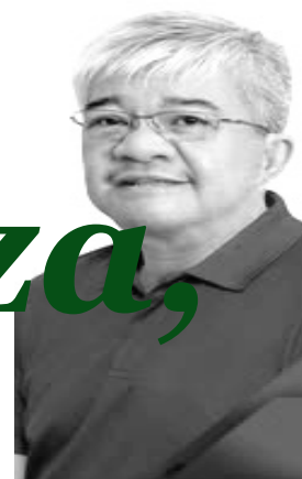
Tanza Mayor Yuri Pacumio