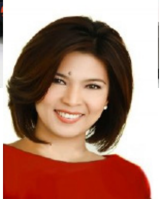
Mayor Lani Mercado- Revilla

Bacoor City Mayor Lani Mercado Revilla likewise lauded the Memorandum of Agreement between the Bureau of Fire Protection-Bacoor City Fire Station and the Liga ng mga Barangay. Under Oplan Ligtas na Pamayanan, BFP-Bacoor and Liga ng mga Barangay will work towards increasing the number of trained and organized communities which could be partners in fire protection efforts, decreasing the occurrence of fires in the most vulnerable parts of communities, and encouraging communities to develop