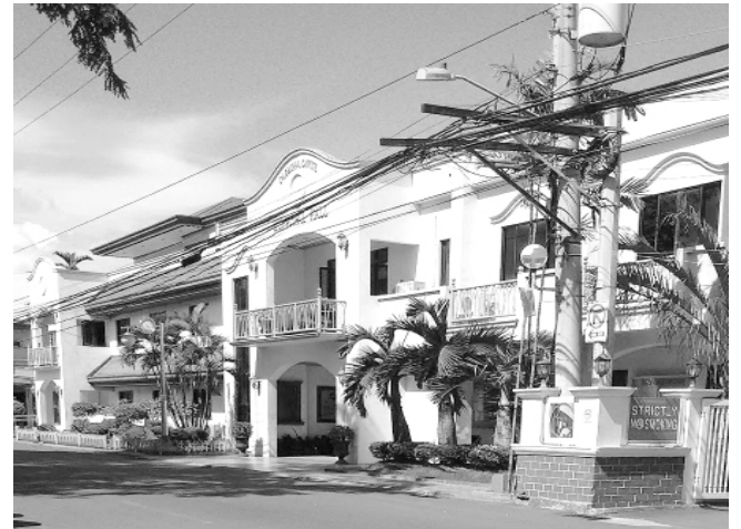
Carmona Municipal Hall

Ipinaliwanag naman ni Commission on Election (COMELEC) Chairman George Garcia na,