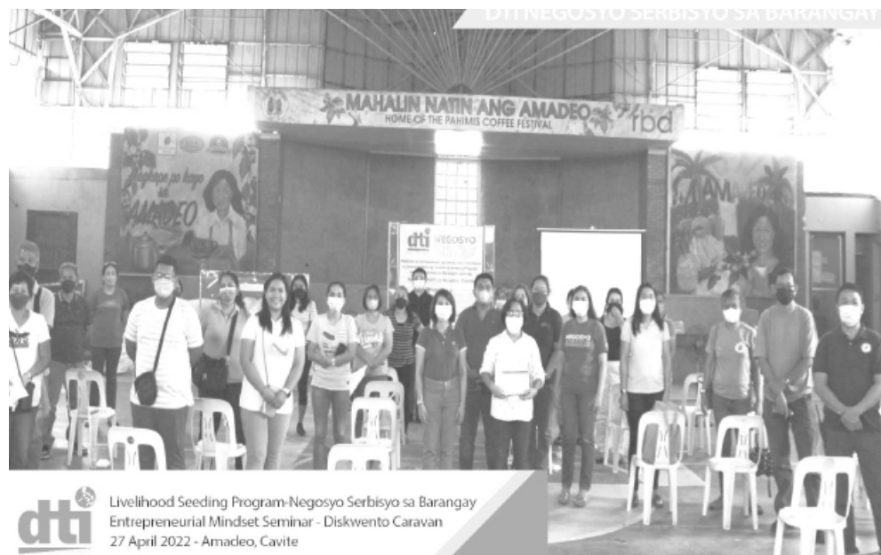
dti Livelihood Seeding Program-Negosyo Serbisyo sa Barangay Entrepreneurial Mindset Seminar - Diskwento Caravan 27 April 2022 - Amadeo, Cavite