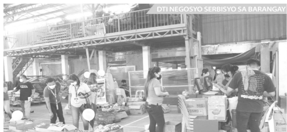
Launching of the Livelihood Seeding - Negosyo Serbisyo sa Barangay in Amadeo, Cavite

Intending to help the country's base of the pyramid during the pandemic, DTI developed the LSP-NSB to support a grassroots approach to enterprise development, increasing the awareness of Barangay Officials about the services offered by the Department through its Negosyo Centers and delivering business development assistance and services in barangays on April 27, 2022