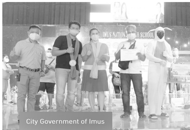
City Government of Imus