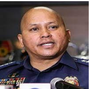
SEN. Dela Rosa

"With the huge number of our kababayans living and working abroad, it is important that policies and programs for the promotion of their welfare and protection must be unequivocally instituted,"