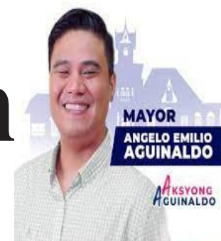
Mayor Angelo Emilio Aguinaldo