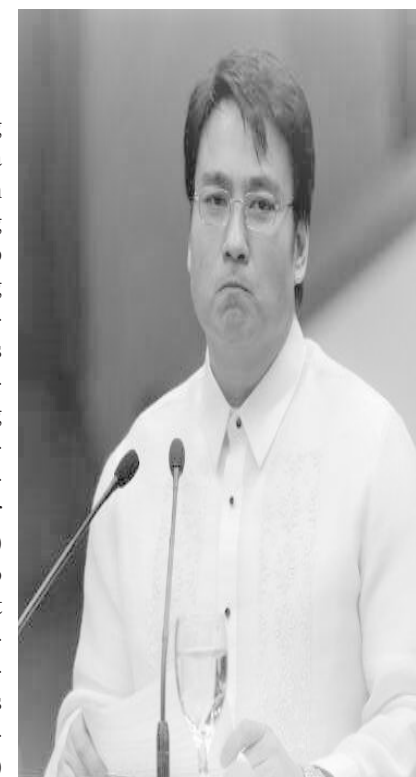
Senator Bong Revilla, Jr.