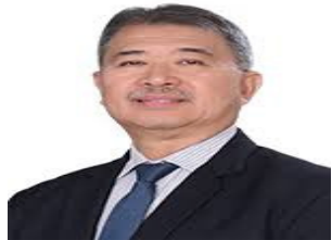
DOST Secretary Fortunato de la Peña