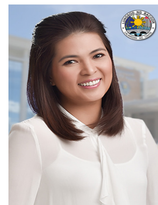
Bacoor City Mayor Lani Mercado-Revilla

"Masasabi po natin para po sa inyo ang pinakamaganda at pinakamahalagang Christmas gift na maibibigay ng Bacoor City LGU, na magkaroon kayo ng isang housing settlement na masasabi nating disente, affordable at sustainable (I can say that the greatest and valuable Christmas gift that