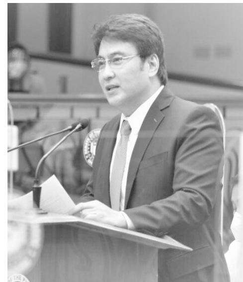
Senator Ramon Bong Revilla, Jr.

Senator Ramon Bong Revilla, Jr. is concerned that the senior citizens and other vulnerable sectors would be discouraged and won't exercise their right to vote in the coming 2022 elections, as the Delta variant of the novel Coronavirus rages on.