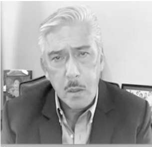
Senate President Vicente C. Sotto III

Sotto noted that while the government is devoted to COVID-19 vaccines, the country's COVID-19 testing has been somewhat neglected. Sotto cited one of the findings of COA in its 2020 report regarding the failure of the Procurement Service of the Department of Budget and Management (PSDBM) to remit to the national treasury P10.87 billion in unutilized funds and remained dormant for years, which could have