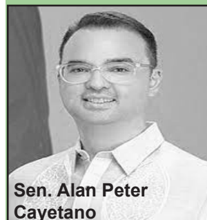
Sen. Alan Peter Cayetano

Senator Alan Peter Cayetano on Thursday reiterated his call to halt all forms of gambling in the country, particularly online gambling, e-sabong, and the controversial operations of Philippine Offshore Gambling Operators (POGOs).