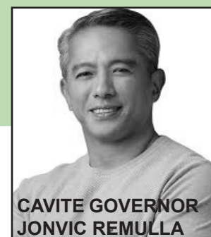
CAVITE GOVERNOR JONVIC REMULLA

With the agreement in place, the Provin-