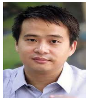
Sen. Joel Villanueva must either be displaced due to their host country's imposition of lockdowns or community quarantines; must either