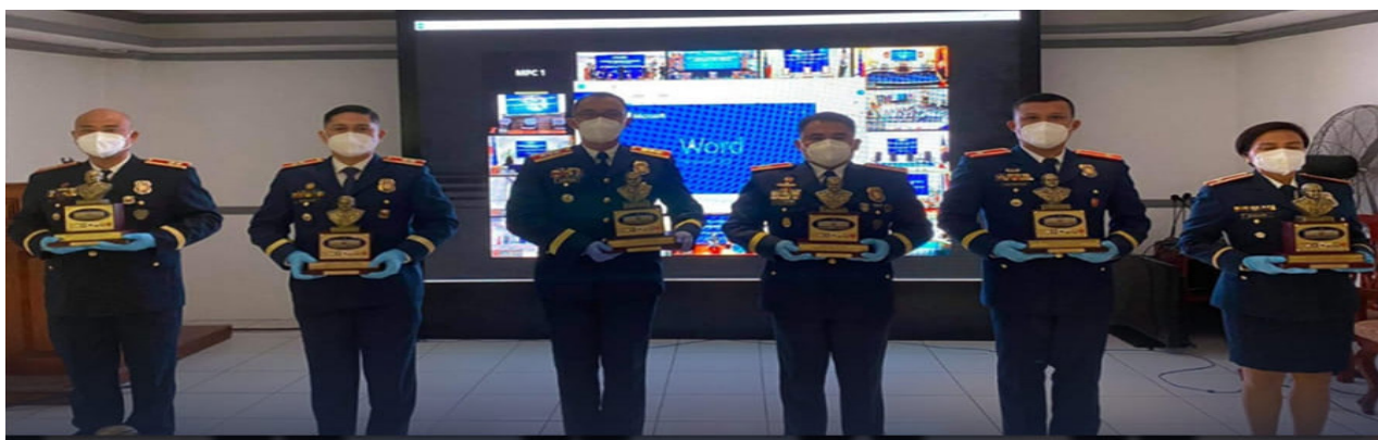
Nakatanggap ng anim na mga parangal ang Cavite Police Provincial Office (CPPO) sa pangrehiyong selebrasyon ng 119th Police Service Anniversary noong Huwebes sa Camp Vicente Lim sa Calamba City, Laguna