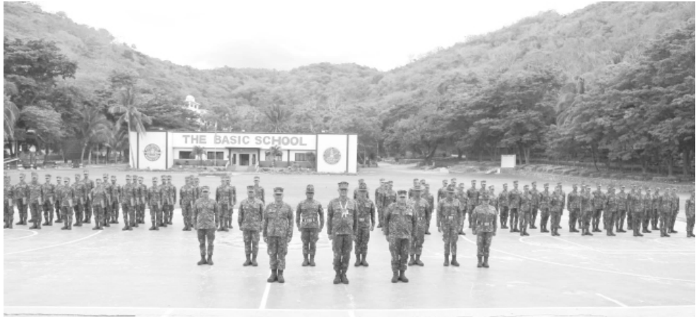
Seventy two (72) soldiers are now part of the Philippine Marine Corps after graduating from the Marine Basic Course at The Basic School in Ternate, Cavite last April 29.

The BRP Teresa Magbanua (MRRV-9701) and BRP Melchora Aquino (MRRV-9702) are part of the DOT’s Maritime Safety Capability Improvement Project (MSCIP) Phase II to intensify the modernization of the PCG.