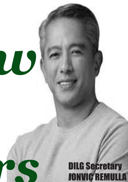
DILG Secretary JONVIC REMULLA

MANILA – Department of the Interior and Local Government (DILG) Secretary Jonvic Remulla on Friday urged local government units (LGUs) to enforce rules and regulations on firecrackers and other pyrotechnics in their respective jurisdiction to prevent firecracker-related injuries.