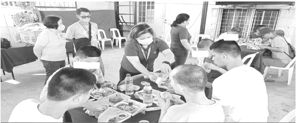
Local Health Insurance Office (LHIO) Dasmariñas conducted the Corporate Social Responsibility (CSR) Activity at Jade Home of Virlanie Foundation, Inc. on December 20, 2024.

The Kadiwa ng Pangulo “Rice-for-All” program resumed Friday, December 27, on its seventh day, targeting more public markets in time for the celebration of New Year. (PND)/ source Pia Cavite