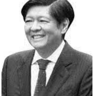
Pres. Ferdinand “Bongbong” R. Marcos, Jr.

The DA and other stakeholders said the program made a dent on the sta-