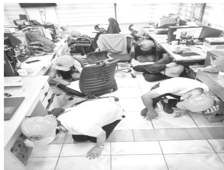
DOH CHD CALABARZON Staff performed the Duck, Cover, and Hold during the 1st Quarter Nationwide Simultaneous Earthquake Drill (NSED) today (Thursday), March 9, 2023.