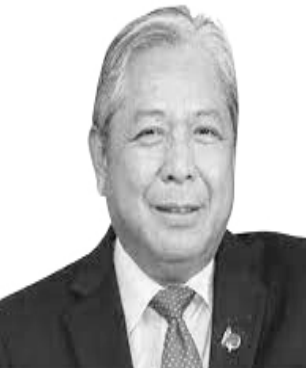
DOTr Secretary Jaime Bautista

Siniguro ng De-partment of Transporta-tion (DOTr) na bukod sa modernisadong mga Public Utility Vehicle (PUV), mag-bubunga ng mas maram-ing job opportunity para sa sektor ng transportation ang pagpapatupad ng Public Utility Vehicle Moderniza-tion Program (PUVMP).