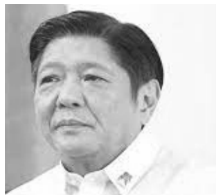
Pres. Bongbong Marcos

SILANG, Cavite (PIA) — President Ferdinand Marcos Jr. on Friday urged graduates of the Philippine National Police Academy's (PNPA) MASIDTALAK Class of 2023 to help restore the public's trust in the uniformed personnel by protecting and defending the peoples' rights regardless of the police force's circumstances.