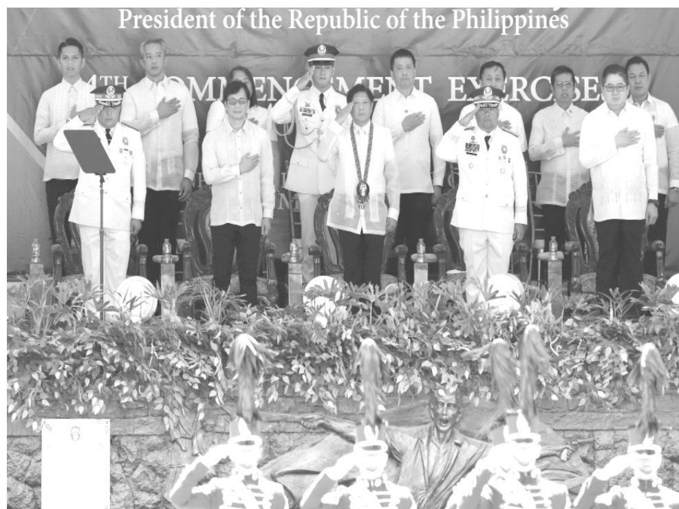
President Ferdinand R. Marcos Jr. leads the 44th Commencement Exercises of the Philippine National Police Academy (PNPA) with the MASIDTALAK (Maaasahang Tagapagsilbi ng Inang Bayan na may Dangal at Katapatan na ang Layunin ay Kapayapaan) Class of 2023 at the Camp General Mariano Castañeda in Silang, Cavite on March 10, 2023.