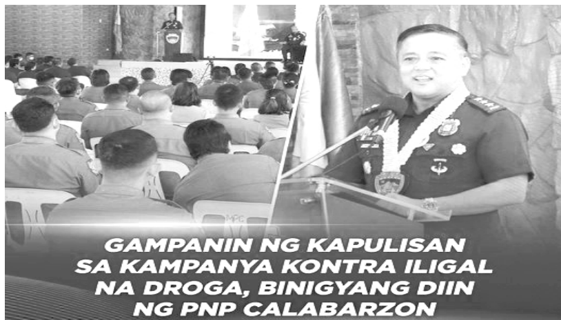
GAMPANIN NG KAPULISAN SA KAMPANYA KONTRA ILIGAL NA DROGA, BINIGYANG DIIN NG PNP CALABARZON