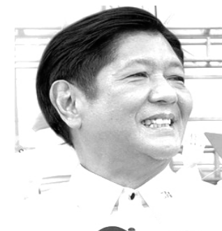
Pres. Ferdinand R. Marcos Jr.

Proclamation 513 covers around 404,141 square meters of land at Calibuyo village in Tanza, Cavite.