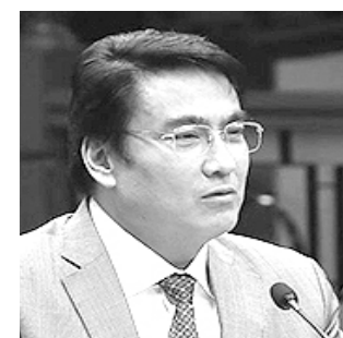
Sen. Ramon Bong Revilla Jr.