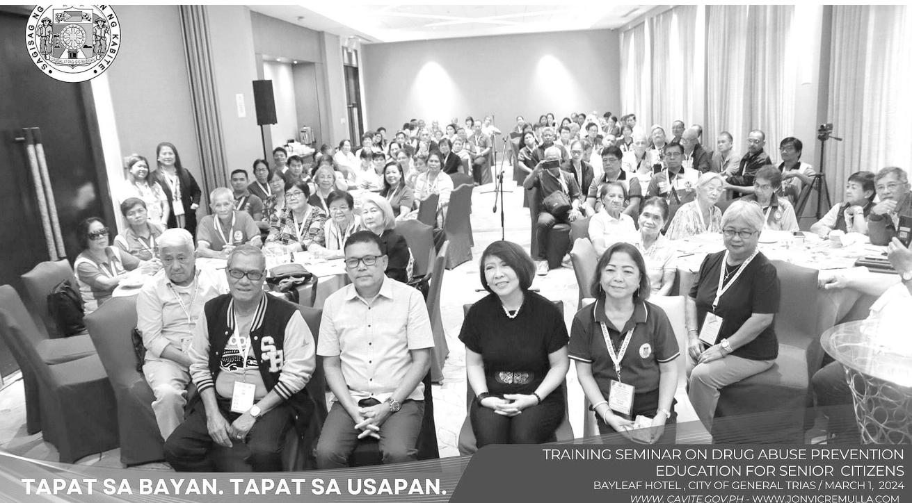
TAPAT SA BAYAN. TAPAT SA USAPAN.