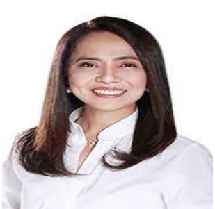
Governor Doktora Helen Tan

Once implemented, the DOTr and LTO said that the local single-ticketing system of Bacoor may become the model of observation for the future implementation of the same traffic system to other cities and municipalities nationwide. (RF/PIA-Cavite; with reports from Bacoor City Information Office)