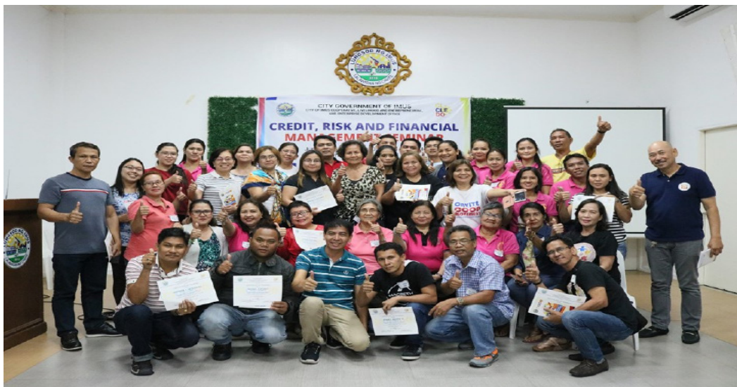
Sa pangunguna ng City of Imus Cooperative, Livelihood and Entrepreneurial, and Enterprise Development Office, isinagawa ang Credit, Risk and Financial Management Seminar noong nakaraang Hunyo 14 at 15sa Imus Multipurpose Hall.

Fraud control measures and reforms were instituted to curb fraud.