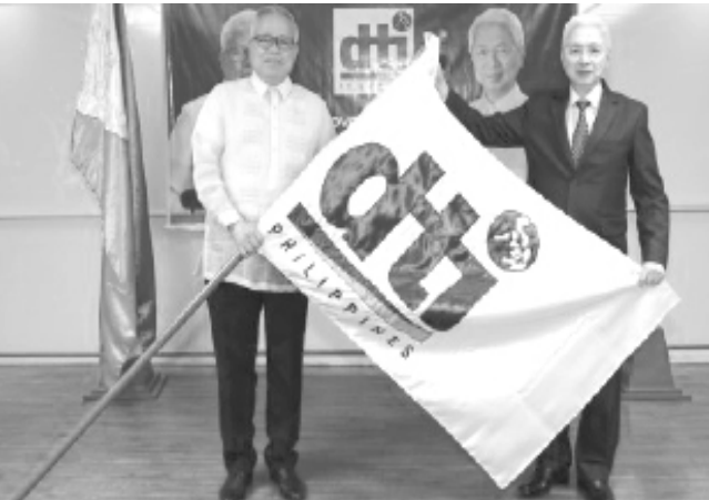
TURNOVER. Trade and Industry Secretary Alfredo Pascual (right) and his predecessor Ramon Lopez hold the agency’s flag during the turnover ceremony held at the Board of Investments Penthouse in Makati City on June 29, 2022. Lopez has finished his six-year term, leaving a “sterling legacy,” according to Pascual.

MANILA – Department of Trade and Industry (DTI) Secretary Alfredo Pascual has identified his priority areas as the new chief of the agency. During the turnover ceremony on Wednesday, which was only broadcast on Friday, Pascual cited that his priorities as new DTI chief would be the development of micro, small, and medium enterprises (MSMEs); promoting the manufacturing sector; facilitating ease of doing business; attracting investments and expanding export markets; and restructuring the organization.