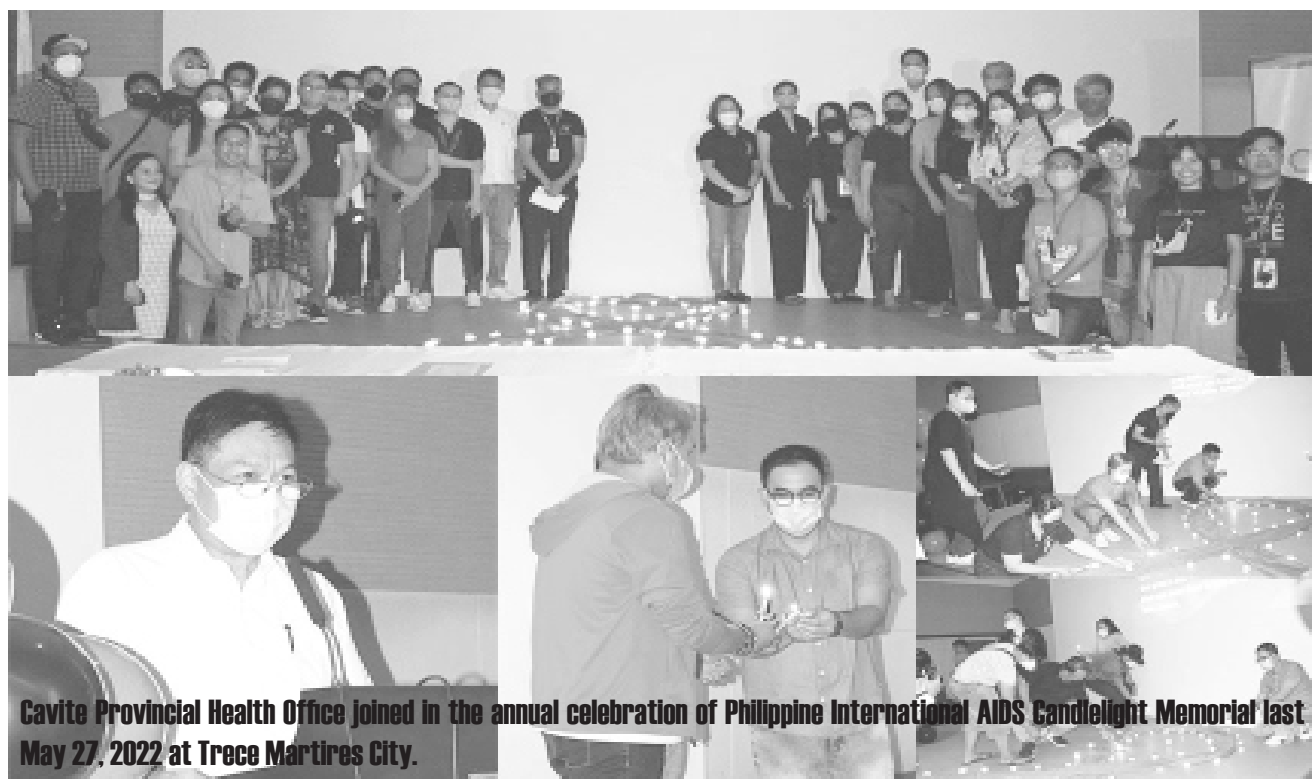
Cavite Provincial Health Office joined in the annual celebration of Philippine International AIDS Candlelight Memorial last May 27, 2022 at Trece Martires City.

In partnership with HIV & AIDS Support House (HASH) and SAIL Clinics, Cavite Provincial Health Office joined in the annual celebration of Philippine International AIDS Candlelight Memorial with the theme "Keeping the light, honoring our rights, radiating pride" on May 27, 2022 at the Cavite Collaboration Center for Public Health Building in Trece Martires City, Cavite which was attended by 52 participants.