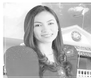
Mayor Jenny Austria-Barzaga