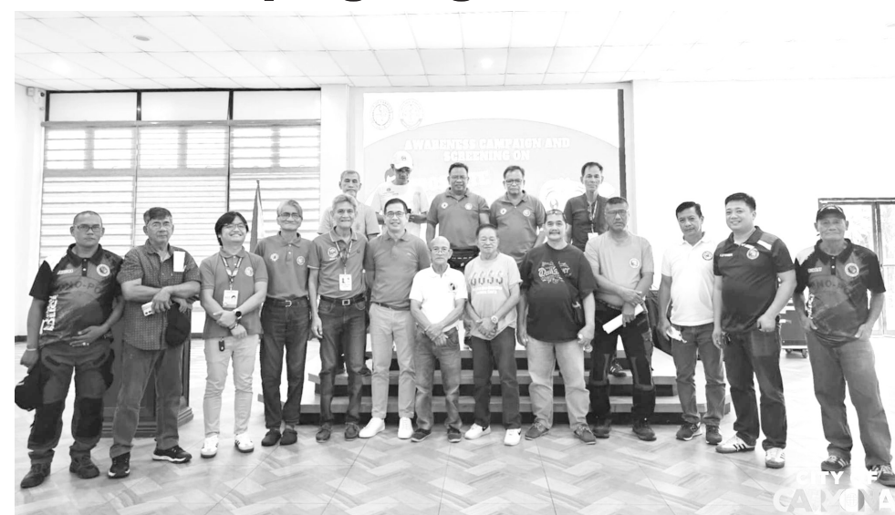
Noong Hunyo 25 ay nagsagawa ng Prostate and Liver Cancer Awareness Campaign ang City Health Office kung saan nagdaos ng Free Prostate (PSA) and Liver Enzymes Screening para sa mga dumalong miyembro ng Men Opposed to VAW Everywhere (MOVE) sa City of Carmona. Layon ng nasabing campaign na mabigyan ng kaalaman ang mga kalalakihan ng Lungsod para maiwasan ang banta ng prostate at liver cancer.