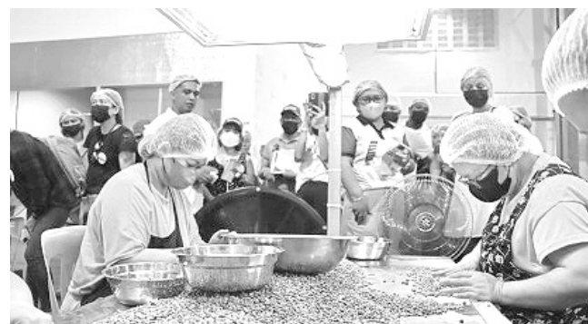
MODEL PROJECT. World Bank representatives visit the Café Amadeo Development Cooperative to evaluate the operation and management of the cooperative and the coffee industry in Amadeo, Cavite on June 5, 2024. The coffee processing and trading project was funded by the Department of Agriculture - Philippine Rural Development Project in the Calabarzon region.