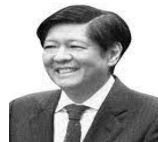
Pres. Ferdinand "Bongbong" R. Marcos, Jr.