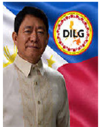
DILG Secretary Eduardo M. Año

“Despite several directives from the DILG and the Dangerous Drugs Board (DDB), the concerned mayors still failed or refused to comply with the said orders and their towns are among those that are without an organized and functional ADAC,” says Año.