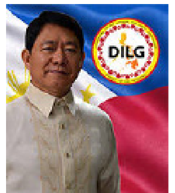
DILG Sec. E.Año

He said that all LGUs should act with dispatch on the enforcement of orders from the Department of Environment and Natural Resources (DENR), Laguna Lake Development Authority (LLDA), and other government agencies in line with the continuous effort to clean