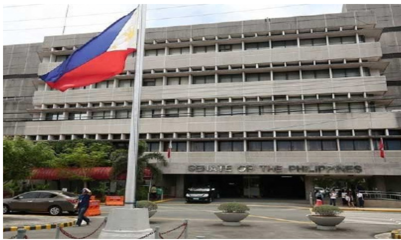
The Philippine Senate building in Pasay City

Incidentally, de Lima is in detention since February 2017 due to charges filed against her by the Department of Justice on allegations that she received money from drug dealers when she was Justice secretary during the Aquino administration. (PNA)