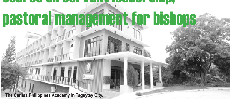
The Caritas Philippines Academy in Tagaytay City.

Caritas Philippines Academy, the Catholic Church's learning and training institute, is launching its first course on servant leadership and pastoral management for bishops.