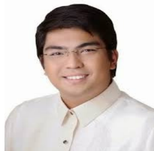
Cavite First District Rep. Jolo Revilla

CAVITE CITY- | The city government formally opened the Unlad Pier last Tuesday, September 3.