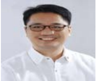
DOH Undersecretary Rolando Enrique Domingo

in areas where there is active circulation since we have environmental monitoring of the whole country,” he said. When asked about the polio case in Cotabato, Domingo clarified that it is an acute flaccid paralysis (AFP) case and not polio. “Our surveillance of polio includes AFP which includes kids who will get sick and