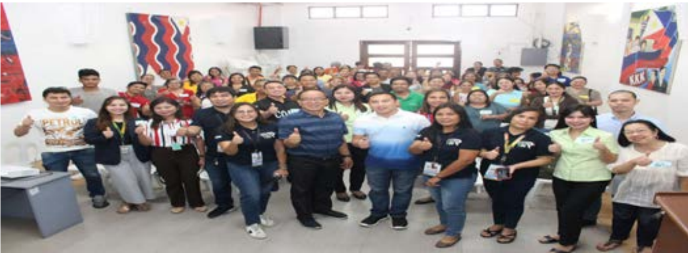
Business to Business Meeting hatid ng ating City of Imus Cooperative, Livelihood & Entrepreneurial and Enterprise Development Office (CICLEDO) noong ika-26 ng Setyembre sa Imus Multipurpose Hall