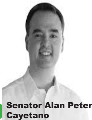
Senator Alan Peter Cayetano

Tatlong daang barangay volunteer at ambulant vendor sa lalawigan ng Cavite ang nakatanggap ng tulong mula kay Senator Alan Peter Cayetano at Department of Social Welfare