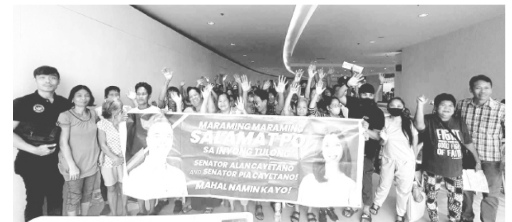
Barangay volunteer at ambulant vendor sa lalawigan ng Cavite ang nakatanggap ng tulong mula kay Senator Alan Peter Cayetano at (DSWD) kamakailan.