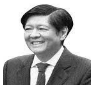
Pres. Ferdinand "Bongbong" R. Marcos, Jr.

Spearheaded by the Department of the Interior and Local Government (DILG) and the Union of Lo-