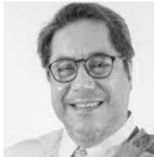
Secretary Ted Herbosa

"Kaunti lamang ang nairecord na namatay sa dengue. Ito ay nangangahulugan na ang mga tao ay agad na kumukonsulta at ang mga