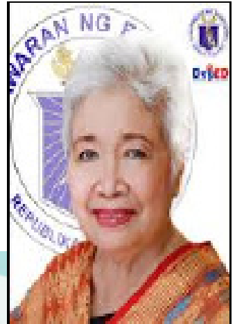
Education Sec. Leonor Magtolis Briones