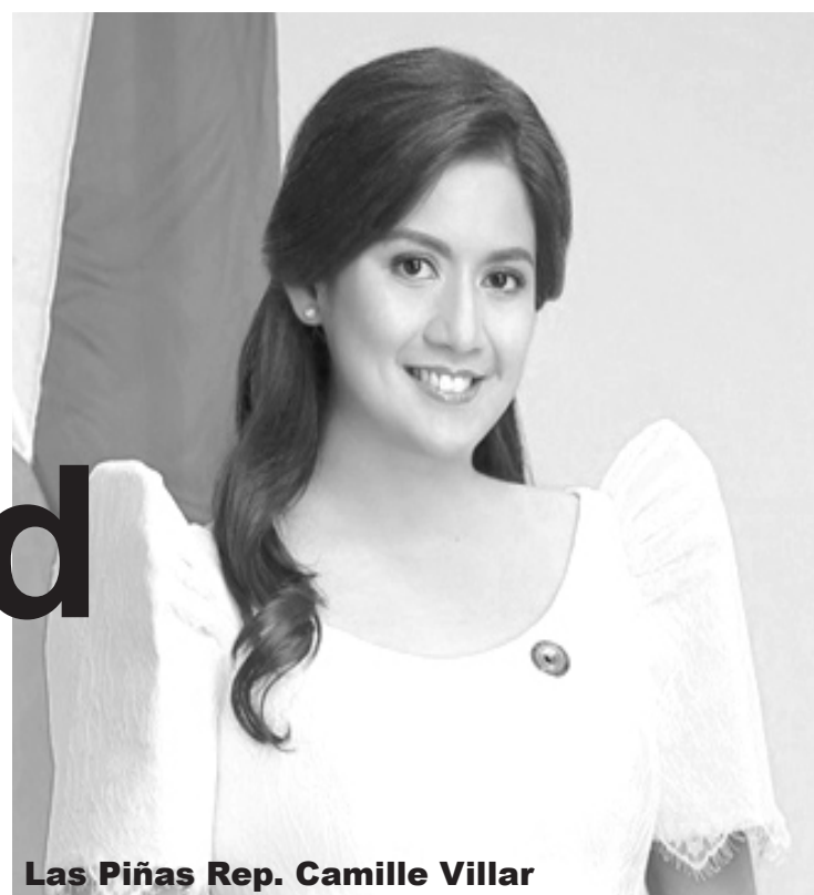
Las Piñas Rep. Camille Villar