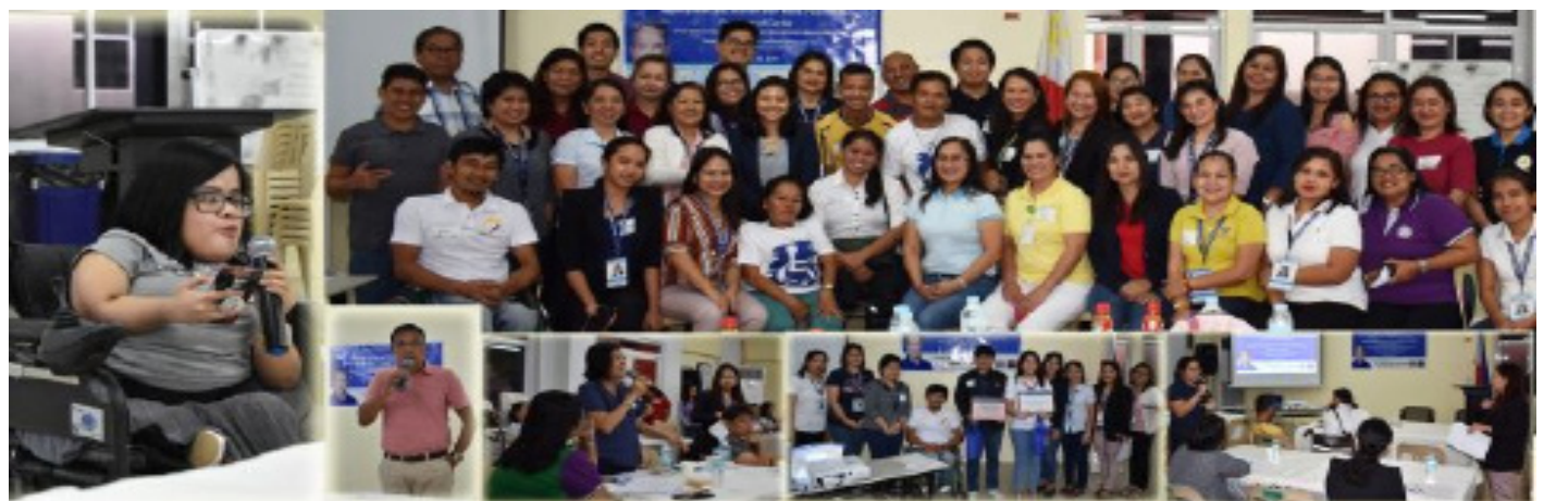
Participants during post National Disability Prevention and Rehabilitation Week Celebration