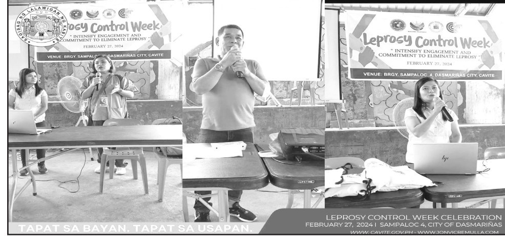
Leprosy Conrol Week sa Dasmariñas City.

ang kahalagahan ng early detection at medical care upang maiwasan ang paglala ng sakit. Nagbigay rin ang lokal na pamahalaan ng libreng prescription medicine at mga ointment.