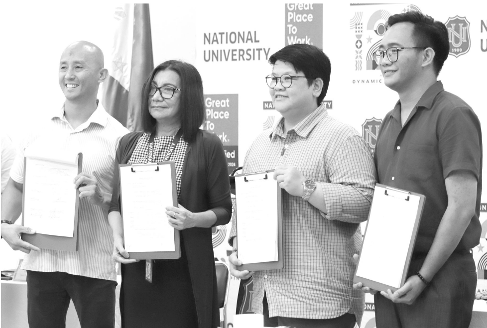
Both parties also pledged support for initiatives countering disinformation, reflecting their shared commitment to serving the public and contributing to nation-building through education and professional development.