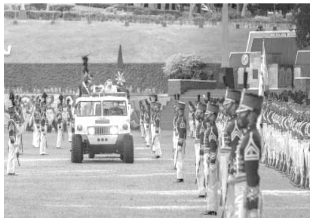
BE PROFESSIONAL. President Rodrigo Roa Duterte attends the graduation rites of the Philippine National Police Academy "Alab-Kalis" Class of 2022 in Silang, Cavite on Thursday (April 21, 2022). He urged the graduates to maintain their professionalism by heeding the call of duty without acting beyond their legal parameters.