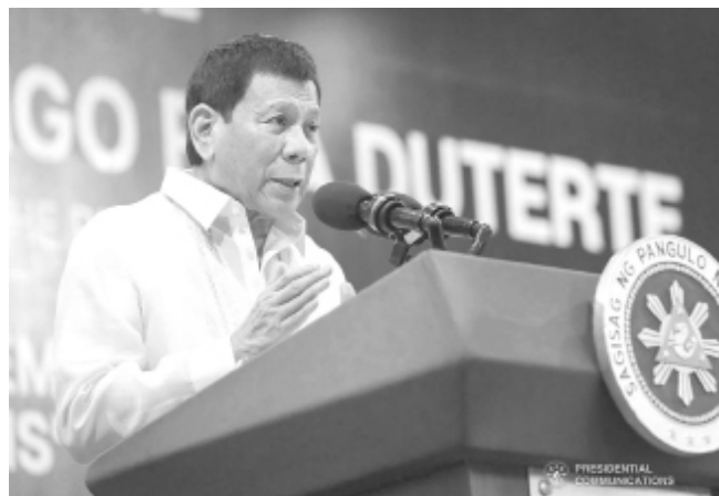
President Rodrigo Roa Duterte delivers his speech during the Philippine National Police Academy (PNPA) 43rd Commencement Exercises at the Campos Grandstand, Camp General Mariano N. Castañeda in Silang, Cavite on April 21, 2022.