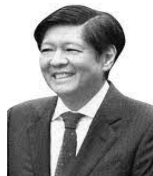
Pres. Ferdinand “Bongbong” R. Marcos, Jr.