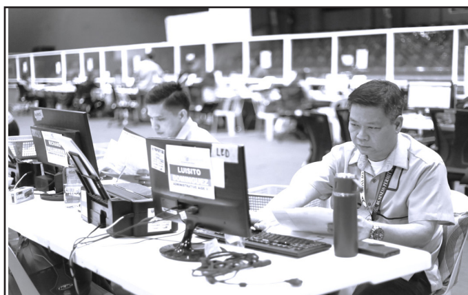
Imus City BOSS