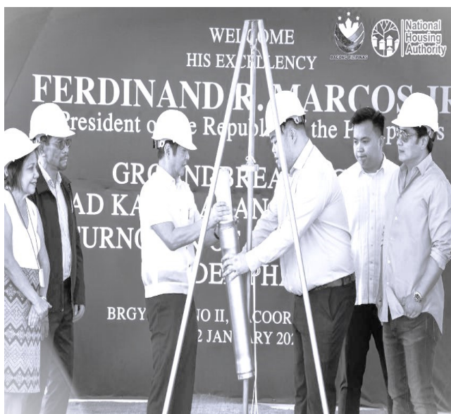
Groundbreaking and awarding ceremonies for the National Housing Authority's new housing projects in Bacoor, Cavite

Meanwhile, the groundbreaking ceremony of Ciudad Kaunlaran Phase II signified the start of construction for the two (2) five-storey buildings which will generate another 120 housing units in total. An additional five-storey building