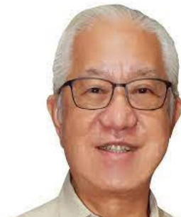
Governor Hermilando Mandanas

In November 2023, Mandanas also visited the General Santos Fish Port Complex in South Cotabato which is recognized as the second largest fish port in