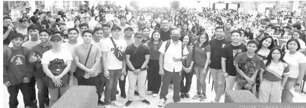
CAVITE CAREER CARAVAN